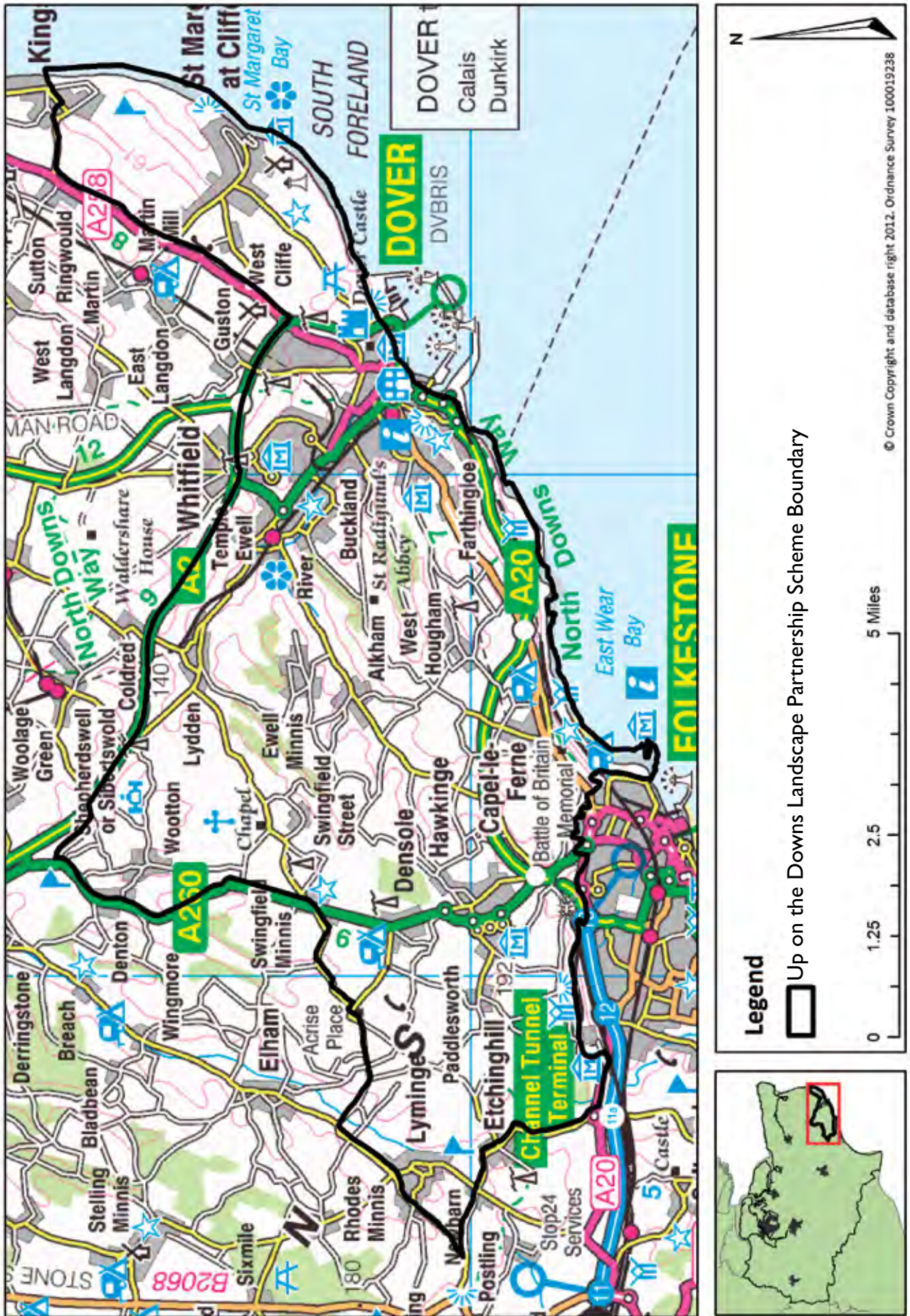
Figure 1: Up on the Downs Landscape Partnership Scheme area